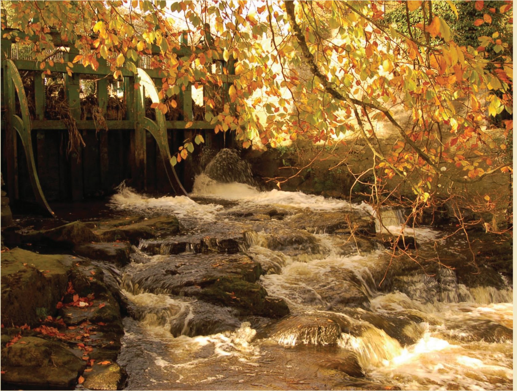
River Mourne, Sion Mills